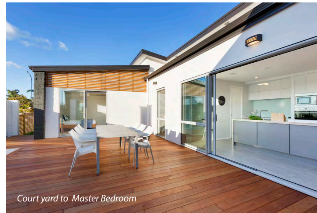
Courtyard to Master Bedroom