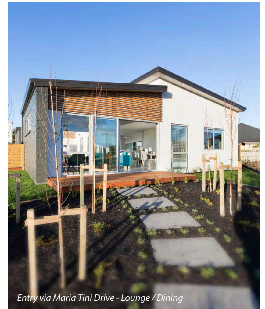
Entry via Maria Tini Drive - Lounge / Dining

The black and white contrast reflects the contradictions in the house. As a showhome it wants to show off but as a home it has to provide shelter. The charcoal brick has a solid look, but on closer inspection it has texture that makes it softer. The bright white plaster gets its softness from the timber screen features. The timber also ties in the court yard deck area. Together the mono-pitch roofs form an open but private, compact but spacious home.