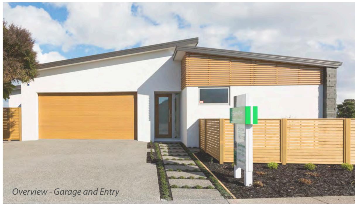
Overview - Garage and Entry