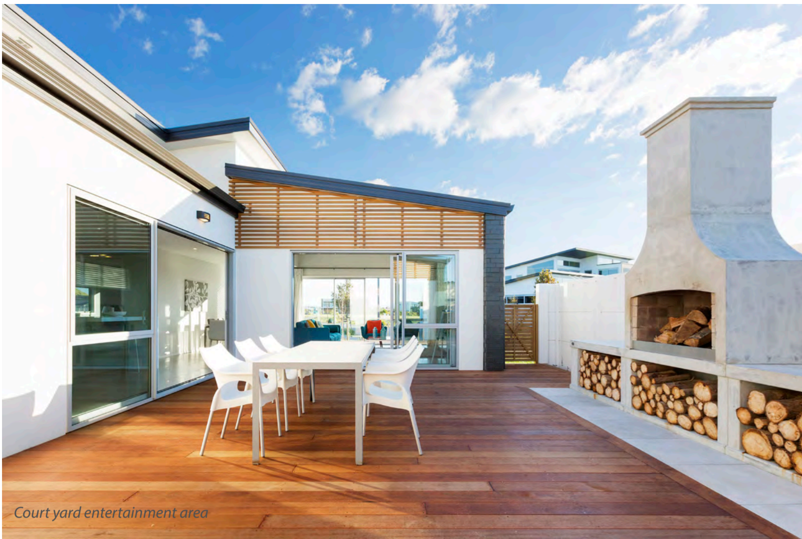
Courtyard entertainment area