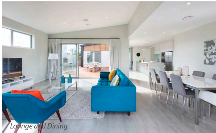
Lounge and Dining

The black and white contrast reflects the contradictions in the house. As a showhome it wants to show off but as a home it has to provide shelter. The charcoal brick has a solid look, but on closer inspection it has texture that makes it softer. The bright white plaster gets its softness from the timber screen features. The timber also ties in the court yard deck area. Together the mono-pitch roofs form an open but private, compact but spacious home.