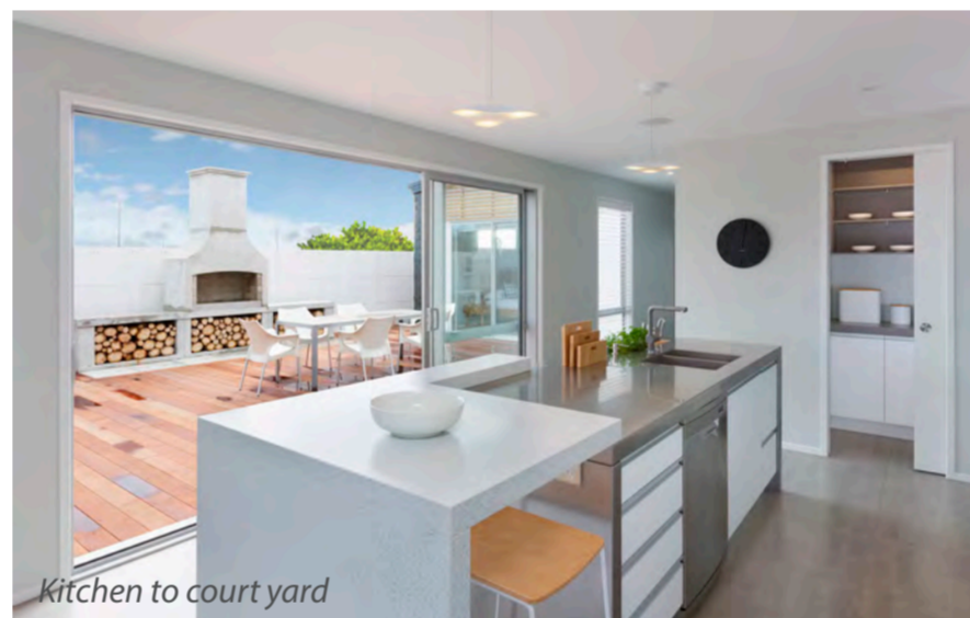
Kitchen to courtyard