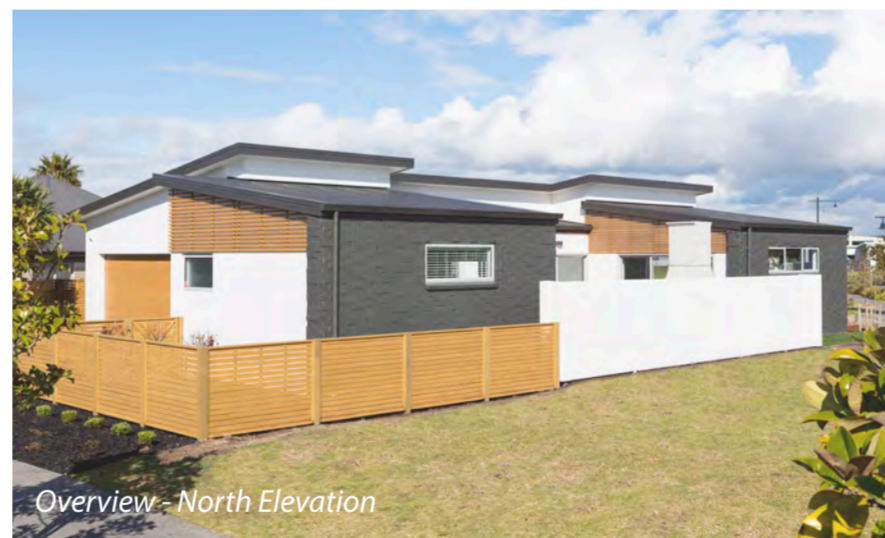
Overview - North Elevation