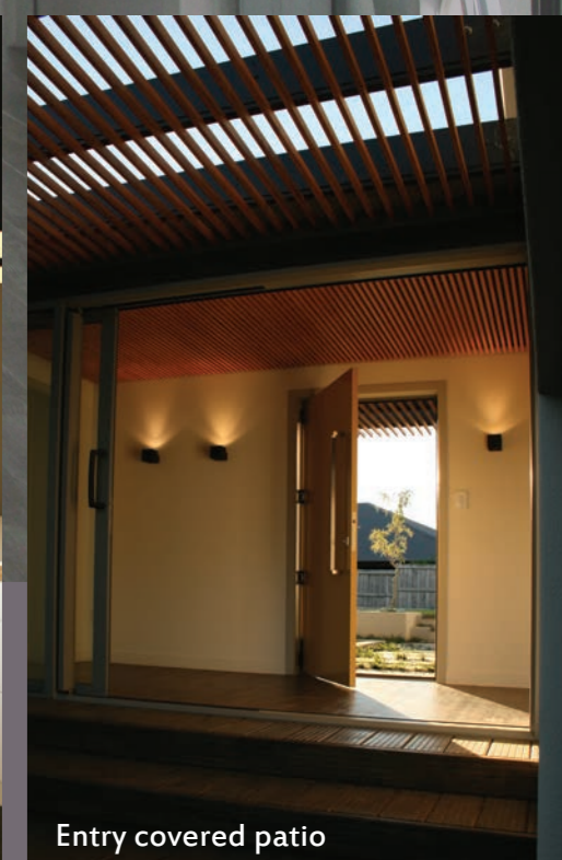
Entry covered patio