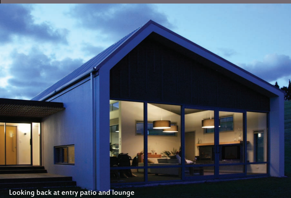
Looking back at entry patio and lounge

The interior spaces were designed to capture light and views. The various angles offer contrast and interest as you move throughout the spaces. Ultimately, this house heightens the sense of time, day and season.